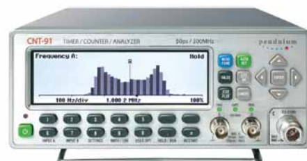
Figure 6: The same result as in Figure 5, now displayed as a histogram.