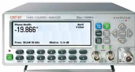
Figure 1: Display showing phase value, frequency, attenuation Va/Vb, and auxiliary parameters.